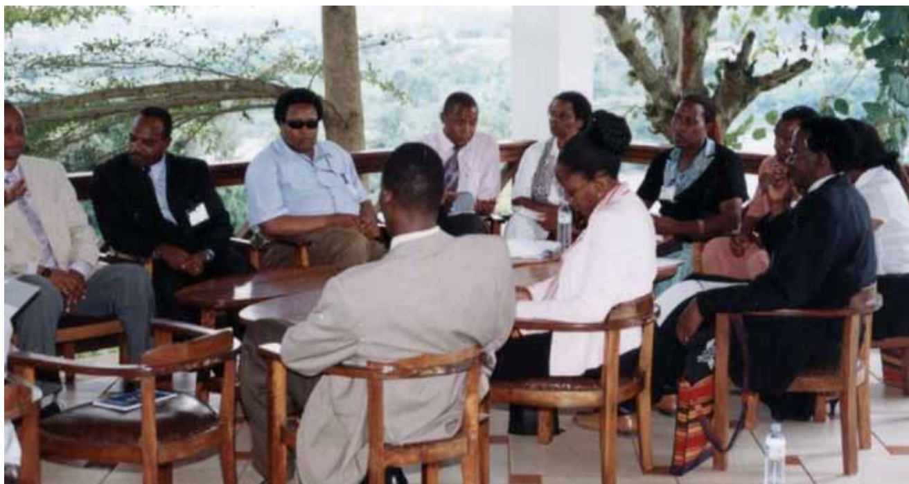
Alumni from Uganda, Kenya and Tanzania at the Jinja meeting, Uganda, 2006.

The alumni have not managed to be actively engaged in causes of a national nature such as the fight against corruption, environmental degradation and other forms of injustices. While it was not their intention to lead such efforts, it was anticipated that the alumni would be seen to be part of these efforts, but this has not yet happened. Much of their involvement has been in debating national injustices and suggesting practical solutions or policy options. The international and Uganda listserves have provided a platform to openly debate social justice issues in the public interest. However, little effort has been made to collectively extend the frontiers of the debates into the public arena. Nonetheless, some alumni have drawn on