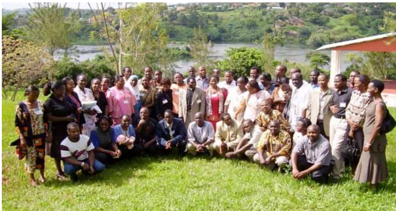
Alumni from Kenya, Uganda and Tanzania attending the East Africa Alumni Meeting at Jinja, Uganda 2006.

The post-fellowship stage has also been characterized by activities specifically designed to support the alumni