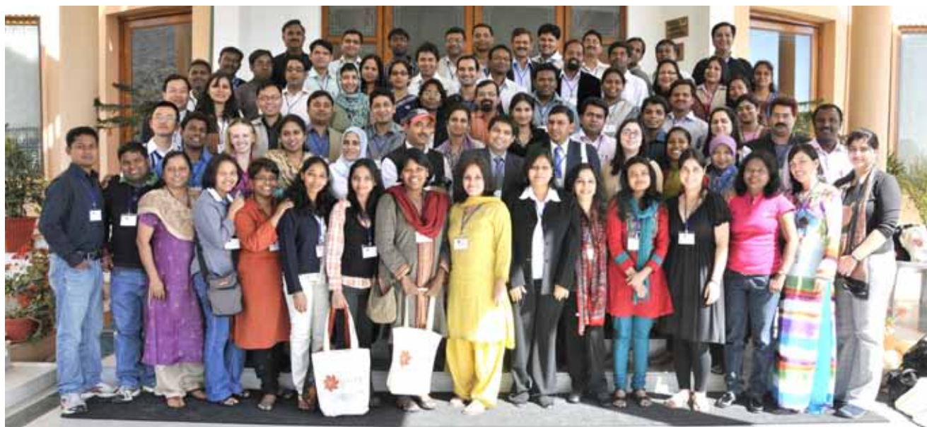
IFP Alumni meeting, Jaipur, Rajasthan, India, February 2010.

In addition to the large meetings, the Governing Board of IFPIAN has met every few months, at least three times a year on average. During these meetings the board members have discussed different strategies to strengthen the network, create synergies and a sense of identity and participation among all members.