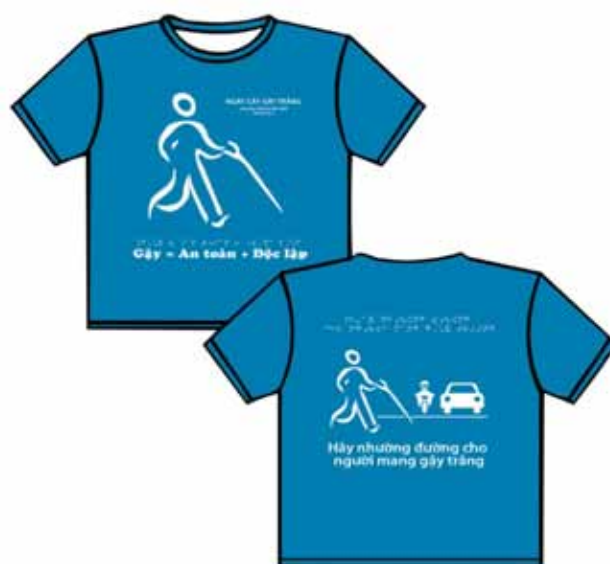
T-shirt designed by vietnamesse alumni to promote the White Canes Day

messages on front and back: 1) to people who are visually impaired: “White Canes = independence and safety” and 2) to the public: “Yield for a person with a white cane”. The first sale of these shirts brought in enough money for the group to purchase 100 white canes to distribute to visually impaired persons who cannot afford to buy them. The group also provides instructions on how to use the canes to those who need assistance.