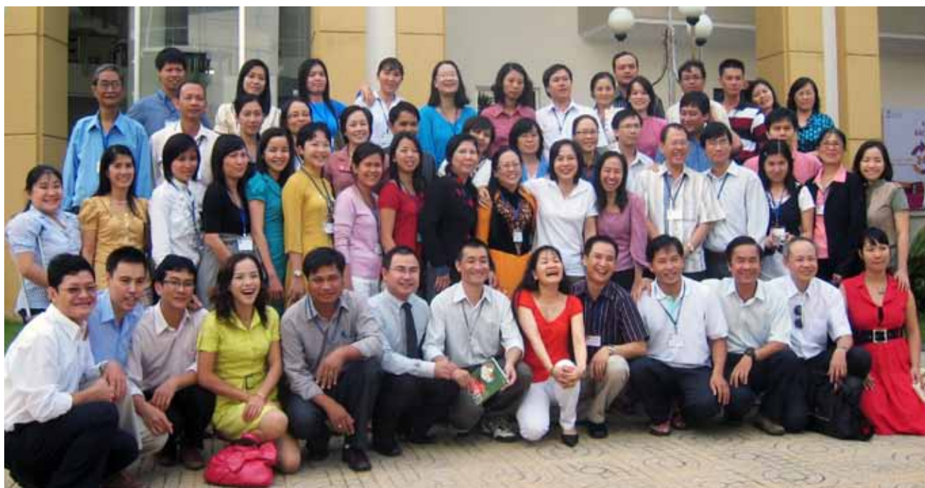
IFP Vietnam Alumni Meeting, Ho Chi Minh City, Vietnam, November 2010.