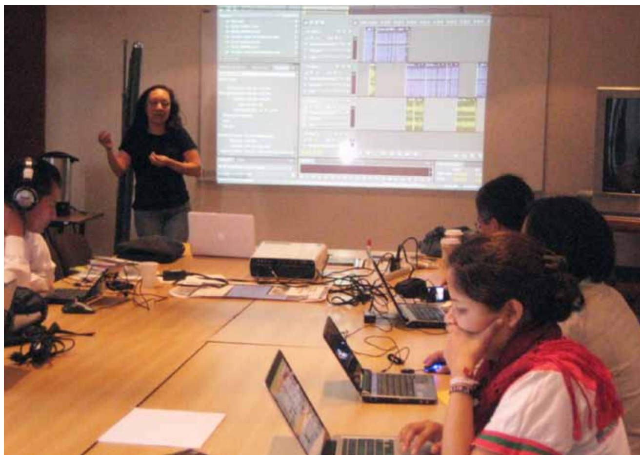
Mexican Alumni at the Community Radio Workshop, Mexico City, Mexico, October 2011.