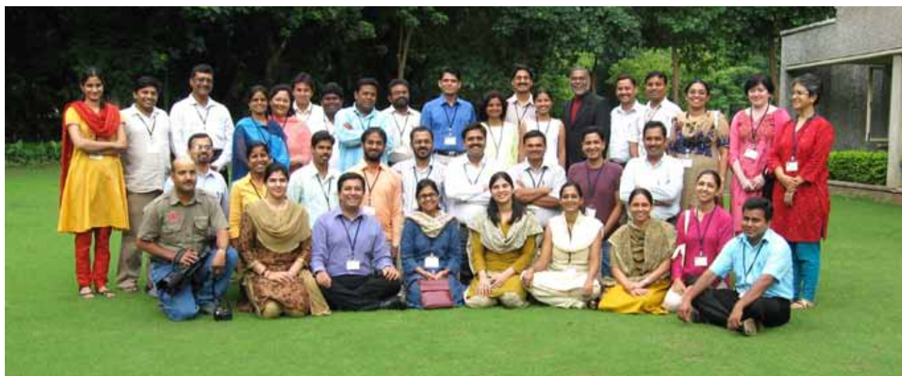
IFP India Alumni meeting, Anand, Gujarat, India, August 2008.

If this is the potential that a single person can materialize, would not it be wonderful to bring all such individuals together under a common umbrella? This was the spirit behind the alumni decision to set up a collaborative framework of social justice action, one that would enable them to step out of their responsibilities within their existing organizations and come together to contribute as a cohesive force of social change practitioners. The trigger for this forum was not just to secure the continuity of relationships. It was