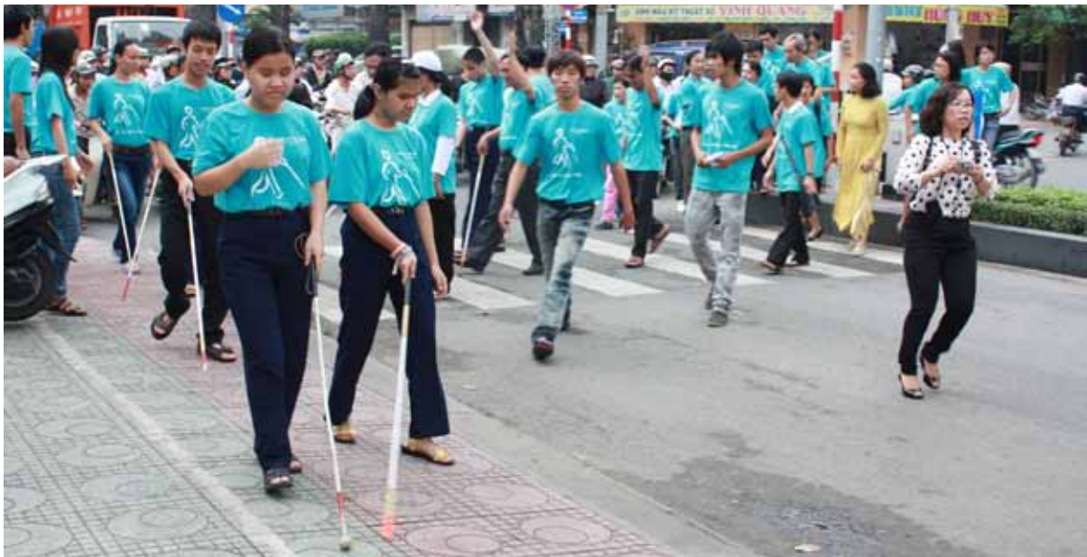
First International White Cane Day in Ho Chi Minh City, Vietnam, October 2011.

Alumni contributed funds to continue IFP legacy in Vietnam. At the October 2011 IFP annual meeting attended by 70 alumni, the group contributed about US$7,800 for the IFP Vietnam Scholarship Support Fund (IVASF). The Fund will provide full scholarships to enable members of disadvantaged communities to study intensive Eng-