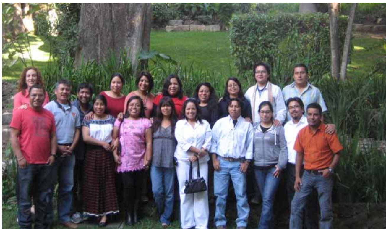
Group of Alumni and other participants attending the Participative Planning Social Projects Workshop, Cuernavaca, Morelos, Mexico, December 2011.

In addition to its great potential as a means to promote the individual and collective professional profiles of members, the consolidation of red IINPIM can greatly benefit Mexico. As demonstrated in the different activities of visibility that have been organized by the IFP/CIESAS Coordinating Office and also during the event organized by Red IINPIM in 2010, the articulate voice of alumni is a catalyst for Mexican society to become aware of the work that still needs to be done in order to become an inclusive and participative society. It also revealed the different and valuable contributions of indigenous women and men that have had access to the highest education standards and remain committed to applying their knowledge and skills to the task of building a more equitable and fair world.